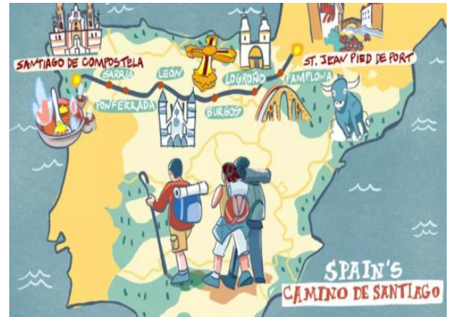
(Right) Her route from east to west.